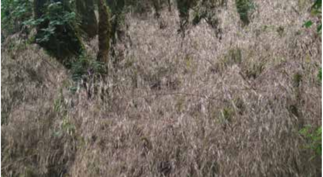
Masting bamboo in Bhutan